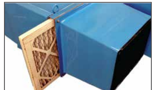
Individually filtered intake and exhaust