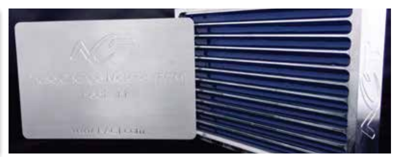
ACT's Phase Change Material (PCM) Heat Sink

The PCM heat exchanger/cold plate design also plays a large role in ensuring a low-weight solution is built. PCMs, such as paraffin wax, commonly used in these heat exchangers, have poor thermal conductivities, often <1 W/m-K. This causes a need for additional features, such as extended surface fins to effectively melt the entire PCM with minimal thermal resistances. Accurate predictions of the effective thermal conductivity of the PCM heat exchanger will help in developing a lean solution. ACT is experienced in design and fabrication of complex PCM packaging, including: