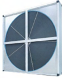
HEAT RECOVERY WHEEL

Know what your options are before making a design decision on a new Heat Recovery System. Take into consideration the ASHRAE 62.1 and 2 indoor air quality clean air requirements, as well as maintenance costs and lifetime cost of ownership and operation.